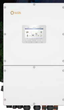
S6-EH3P(30-60)K-H-US (Coming Soon)