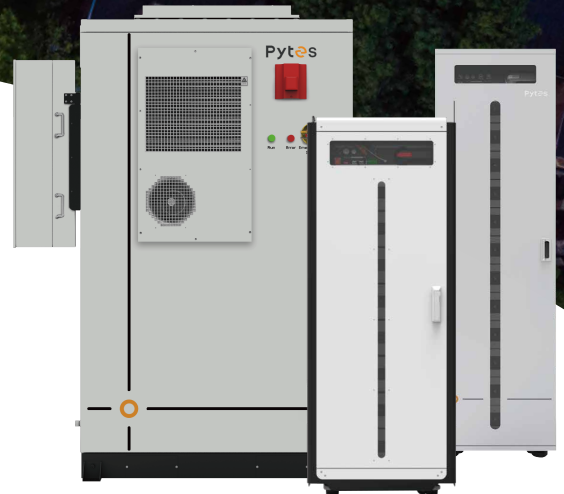
Pytes HV Series Batteries