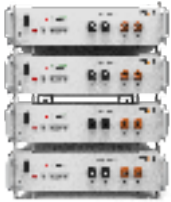
E BK1 hold up to 1"E-BOX 48100R, stack up to 6"E-BOX 48100R