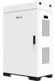
Forest RB Plus hold up to 4"E-BOX 48100R