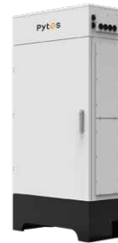
R-BOX-OC hold up to 4"E-BOX 48100R