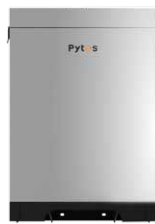
R-BOX-NEMA3 hold up to 2"E-BOX 48100R